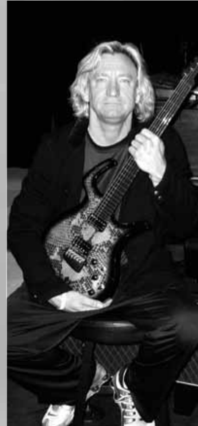
JOE WALSH The Eagles