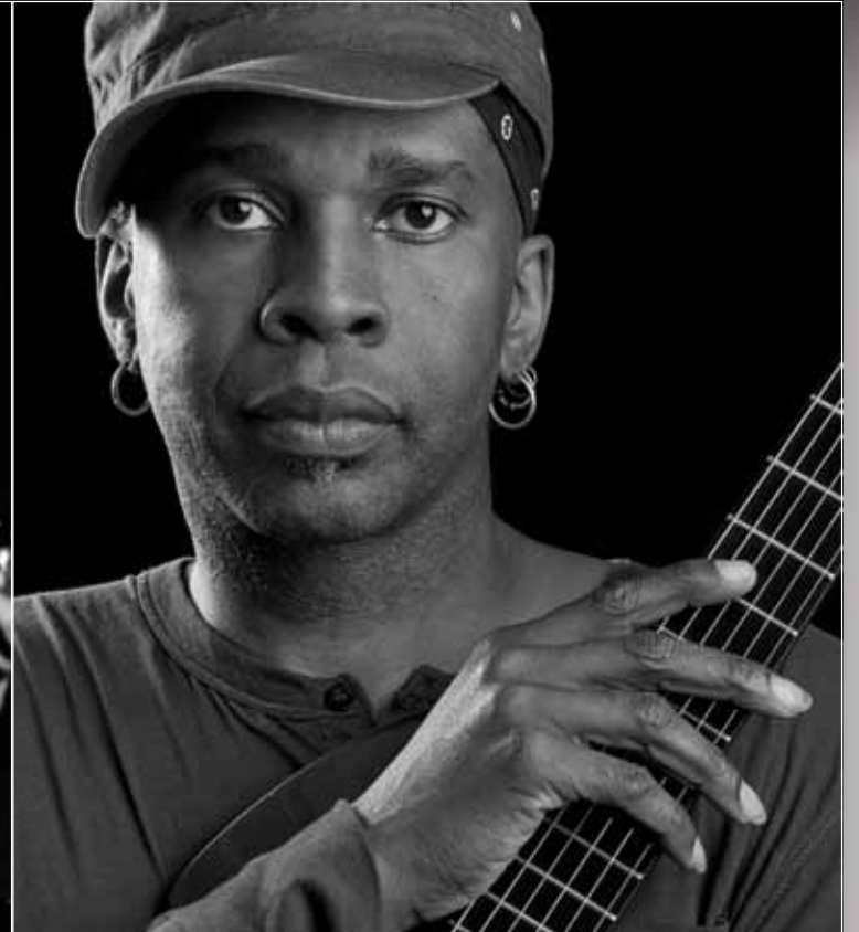
VERNON REID Living Colour